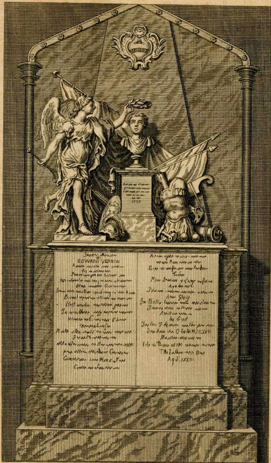
Monument of the late Admiral Vernon.